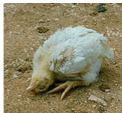
Same symptom in a broiler.