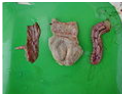
PM lesions on proventriculus, gizzard and duodenum.