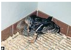
Torticollis in a mallard .

In acute cases, the death is very sudden, and, in the beginning of the outbreak, the remaining birds do not seem to be sick. In flock with good immunity, however, the signs (respiratory and digestive) are mild and progressive, and are followed after 7 days by nervous symptoms, especially twisted heads.