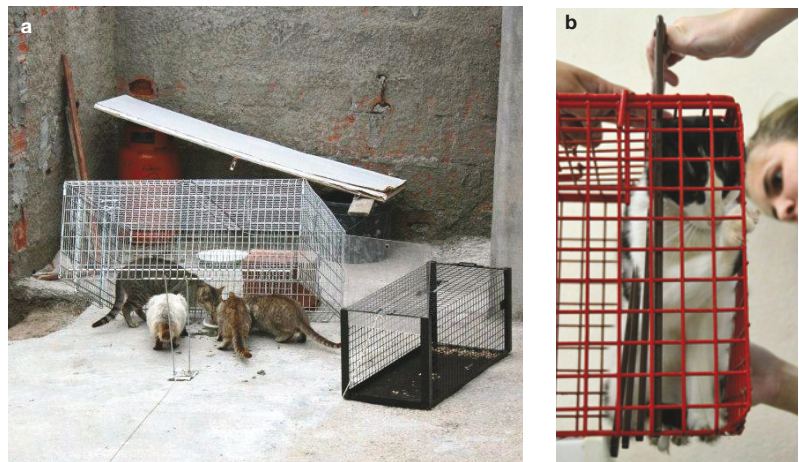
Figure 4 Community cats in TNR programs (a,b) should receive FPV, FHV-1, FCV and rabies vaccines at the time of surgery.

Vaccination programs for breeding catteries should be limited to those diseases that are relevant, determined by analysis of risk factors.