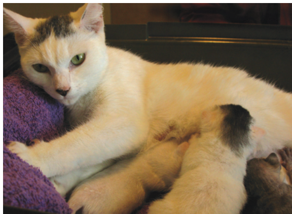
Figure 1 Kittens are more susceptible to infection than adult cats are, and are a principal primary target population for vaccination.

The risk of infection and subsequent development of disease varies with a number of factors including the age and health of the cat, magnitude of exposure to the infectious agent, the pathogenicity of individual agents, the geographic prevalence of infection and the vaccination history of the cat. Some of the factors that negatively affect an individual animal's ability to respond to vaccination include interference from maternally derived antibodies (MDA), congenital or acquired immunodeficiency, concurrent disease or infection, inadequate nutrition, immunosuppressive medications, chronic stress and an aging immune response. Additionally, some vaccinal agents (eg, FPV) will induce a much stronger protective immune response than others (eg,