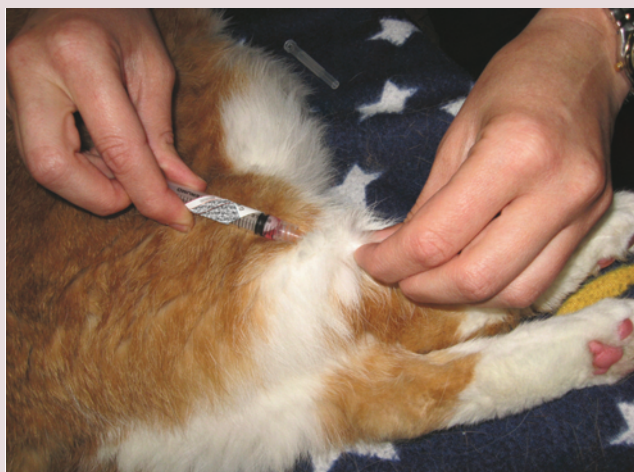
Figure 9 Administration of rabies vaccine subcutaneously below the right stifle.