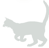
Figure 2 Pet cats that spend any time outdoors are at greater risk of exposure to many infectious diseases compared with indoor-only pet cats.

Veterinarians should reassess risk factors for exposure to infectious disease at least once a year, as changes in the health of the animal or its lifestyle may dictate modifications in vaccinations needed.