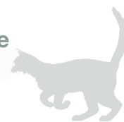
Table 3 Recommendations for vaccination of shelter-housed cats

For diseases of concern in shelters, vaccines may be indicated at an earlier age and administered at shorter intervals compared with schedules for pet cats.