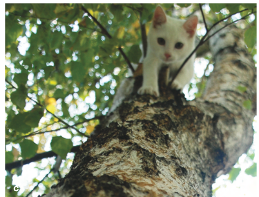
Table 2 summarizes vaccination recommendations for household pet cats.

Developing universal guidelines for vaccination of household pet cats is complicated by the lack of a clear definition of what is, and what is not, a ‘pet cat’. What follows are reasonable recommendations, based on scientific evidence and expert advice, applicable to most cats presented to private practitioners. Differences in cat population density, introduction of new cats, and exposure risk are dynamic variables that the veterinarian must take into consideration when recommending any vaccine for any cat. It is advised that veterinarians reassess risk factors for exposure to infectious disease at each visit (at least once a year), as changes in factors such as the health of the animal or its lifestyle may dictate changes to vaccination needs.